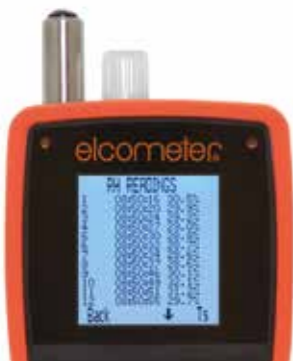
Review individual readings

Dustproof and waterproof gauge with fully sealed sensors (equivalent to IP66)