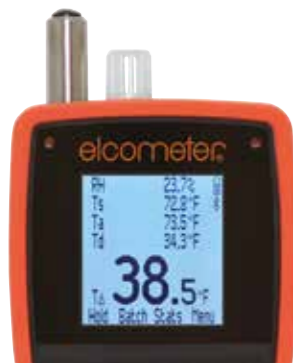
View up to 5 user selectable statistics on screen

Integrated magnets allow the gauge to be attached to the substrate during remote logging