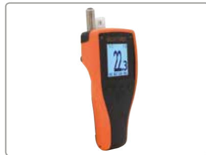
Waterproof and rugged to IP66