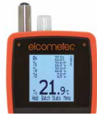
Large easy to read measurements in degrees °C or °F

STANDARDS: BS 7079-B4, IMO MSC.215(82), IMO MSC.244(83), ISO 8502-4, US Navy NSI 009-32, US Navy PPI 63101-000