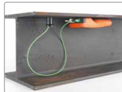
Remote monitoring of climatic parameters