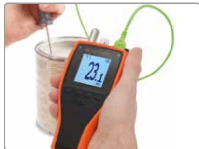
Te - Ideal for use as a simple thermometer