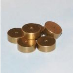
5 gram brass weights to increase needle load.