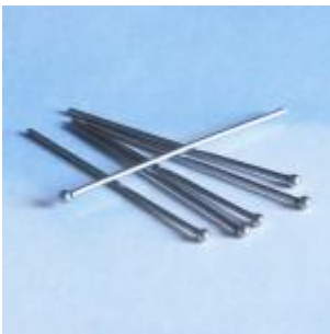
2mm ball ended stainless steel needles.