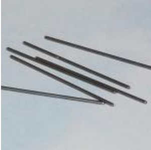
Hemispherical ended stainless steel needles.