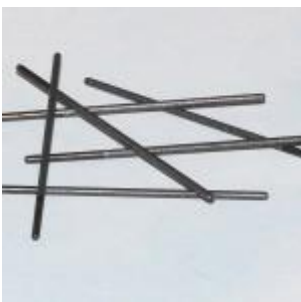
Teflon coated needles for specialist applications (coated one end).