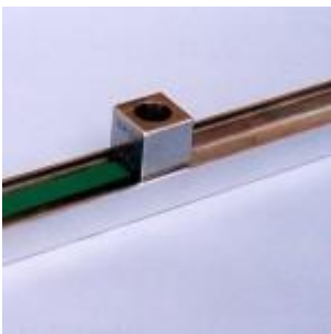
Casterguide for use in conjunction with the paint film applicator