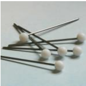
5mm PTFE ball ended needles for specialist applications.