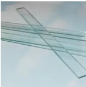
Glass test strips