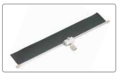
Right angled rubber probe