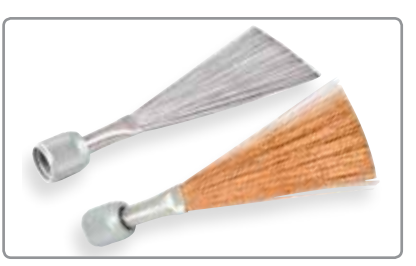
Band brush probes