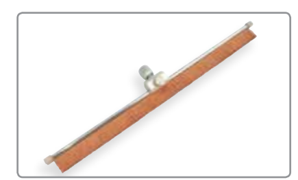
Right angled wire brush probe