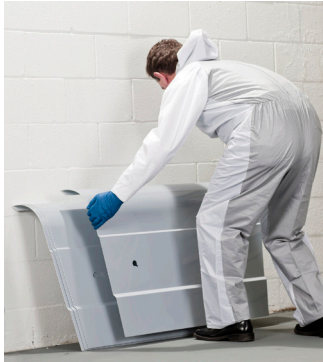
The Q-PANEL automotive refinish training system is a cost-effective simulation of hoods and fenders.

These custom panels are most cost-effective when there are quantities sufficient to allow an economical production run, and when the material is available from our stock metal or readily available alloys. Contact Q-Lab with your custom panel specifications now!