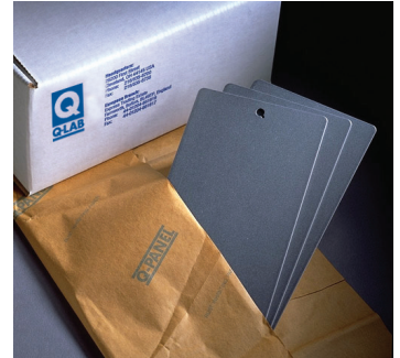
Panels are stored completely clean and, in most cases, can be used right out of the box.

These panels are thicker and harder than our regular steel, to resist the stress of lap shear testing of high strength adhesives. These panels do not have our signature, trademarked Q-shaped hole.