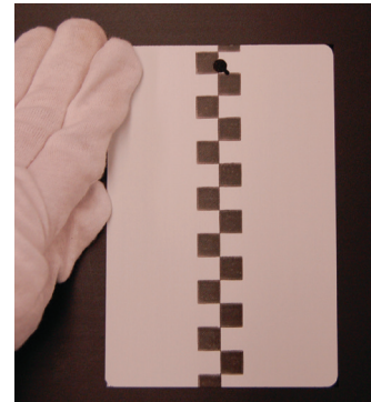
A variety of different pre-painted, patterned and other specialty panels can be made upon request.