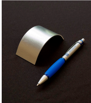
Some aluminum panels of 3" or wider can be curved with a minimum order of 100 panels.