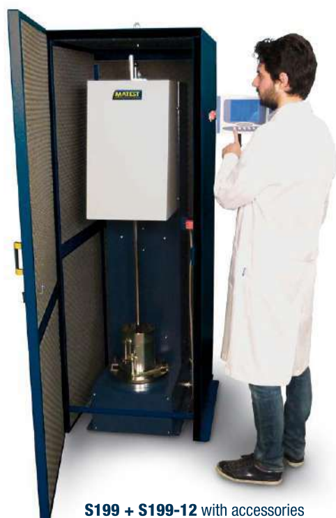
S199 + S199-12 with accessories

S198-23 Kit of two devices fixing the mould to the table.