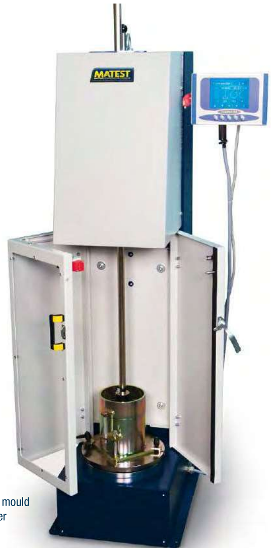
S199 with mould and rammer