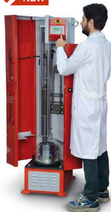
S199TS + S199T-03