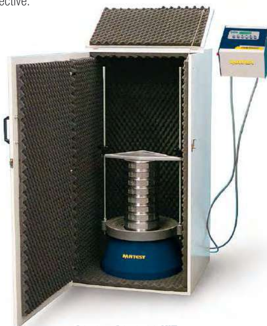
A058 + A059-03 KIT

For the sieve shakers A059 series and A060-01, lined internally with sound-proofing material for noise reduction in compliance with CE Directive.