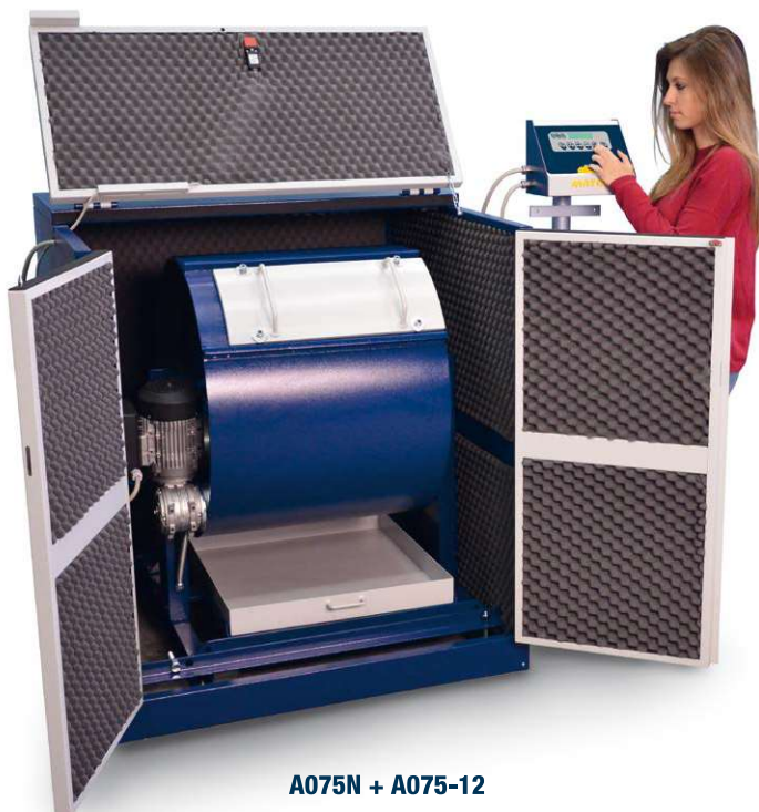
A075N + A075-12

A076-02 SET OF 12 ABRASIVE CHARGES, conforming to EN | NF Standards.