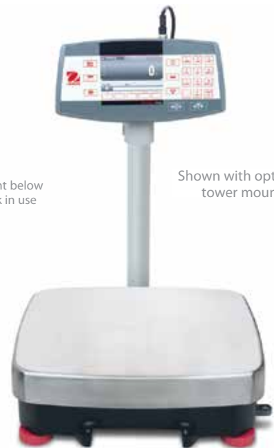
Shown with optional tower mount