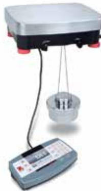
Weight below hook in use

Additionally, a weigh below hook offers the functionality to perform specific gravity tests or weigh items that cannot be easily placed on the weighing platform.