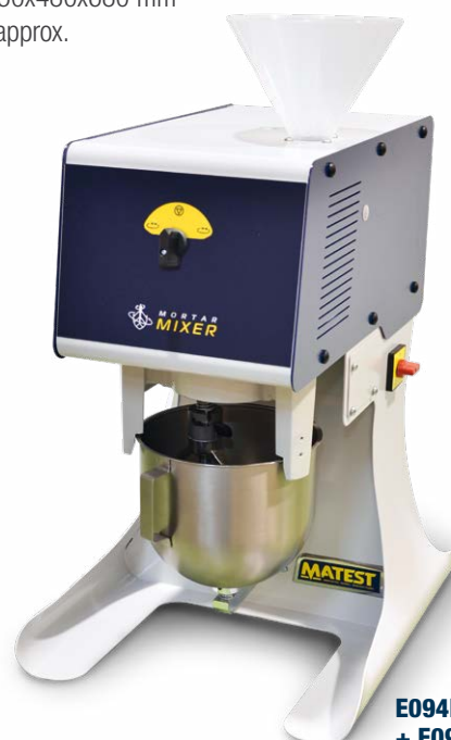
E094NSP + E095-03