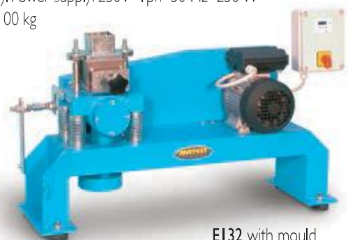
EI32 with mould