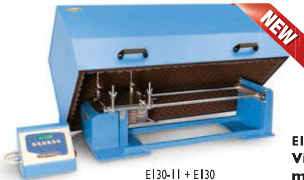
EI30-II + EI30