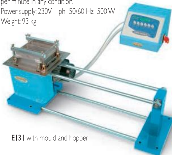
EI31 with mould and hopper